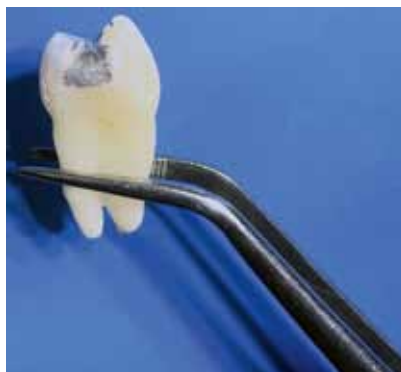
Sample tooth with amalgam filling routinely used in clinical practice

The American Dental Association has reported that 100 million amalgam filling procedures are performed every year in the United States. However, since 2008, the use of amalgam fillings has been forbidden or restricted in Sweden, Norway, Denmark, and Germany. In addition, the European Parliament has adopted a ban on the use of amalgam in clinical practice for children younger than 15. Nevertheless, the use of dental amalgam fillings remains popular despite the controversy surrounding its potential effects on human health.